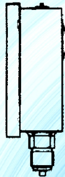
Bottom Entry Direct Mounting